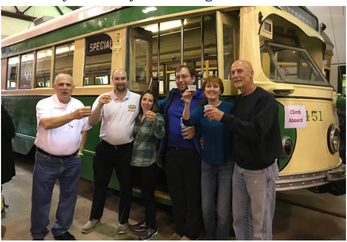
Beer & Wine Tasting 2018

The 2018 season started off with four days of Easter Lunch Studios drew caricatures of the visitors. On