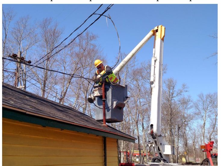
Line Shop Power Drop Repaired

Questionable signal bonds were replaced.