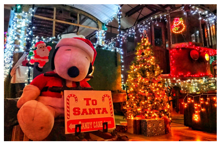
Winterfest Entrance to Santa Line 2018