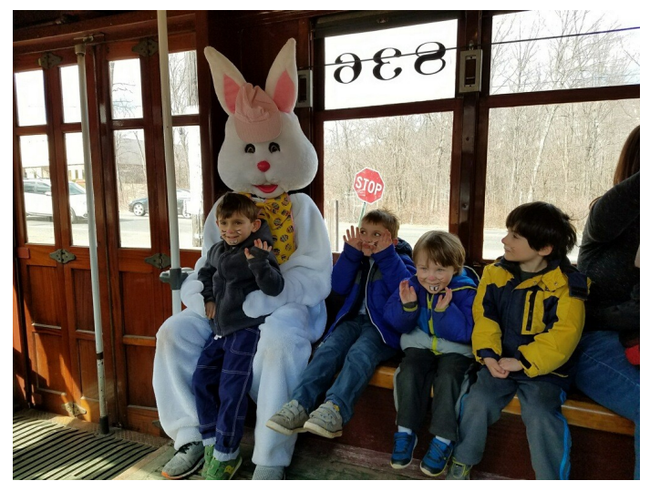
Easter Bunny Fun Day 2018

Fun. The Easter Bunny interacted with all of the May 31st Sanford and Hawley rented the Museum for happy visitors. Each child made Bunny Ears, their Vendor Appreciation Outing. The front lawn and participated in a Scavenger Hunt, enjoyed trolley Visitor Center were packed with employees, vendors, rides, and of course took their picture with the Easter displays, food trucks and even a DJ. The trolleys ran Bunny himself. We hosted 1,804 visitors for the four continually and everyone had a great time! days!