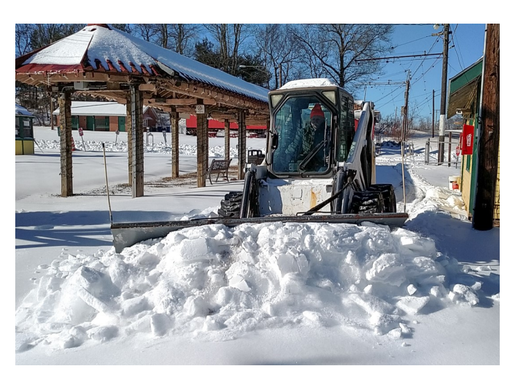
Bobcat Plowing Snow at North Road 1

Be it the In October the Museum purchased a used 2008 doors, building the corn box and hauling hay bales support the myriad of tasks that need to be done Being smaller and more tractor to move stone, his work behind the scenes is maneuverable than our Case Backhoe, yet big enough to lift over a ton 13 feet, it's been a great addition to our maintenance fleet. The backhoe was February began the conversion of the single car purchased with a wide bucket, however we've since garage building next to the substation from a dead purchased a used 8-foot snow blade and a set of storage space to our Line Shop. After a good cleaning forks. With the snow blade we can do the "detail" out, a new side entrance door was installed, the roll snow plowing around the property after our up garage door repaired, and storage cabinets were contractor has done the heavy clearing of our installed. More work is needed, but we now have a entranceway, main parking lot and the parking lot place for the convenient storage of tools and behind the Visitors Center. (One forgets how much property we have that needs snow plowing.) With the forks we're able to lift ties, timbers, switch stands,