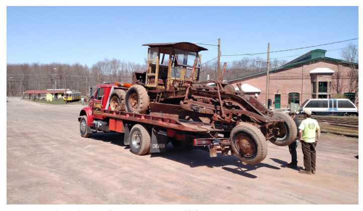
Removing long-forgotten stuff from the museum property