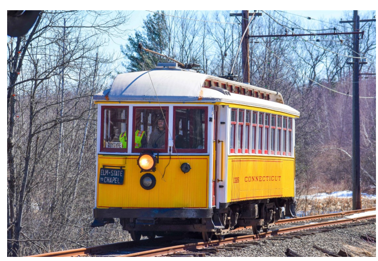
1326 Operating during Trolley Care Day

We all worked tirelessly on many projects including starting the first phase of improving facility drainage, continued signal work, new back saver switch stands and crossties in Kelly Yard, and a new Key Fob Security System. In addition, the roof on the former snack bar was completely replaced, the roof on the Visitor Center was repaired, and we purchased a Bobcat to assist us in many current and upcoming projects at the museum.