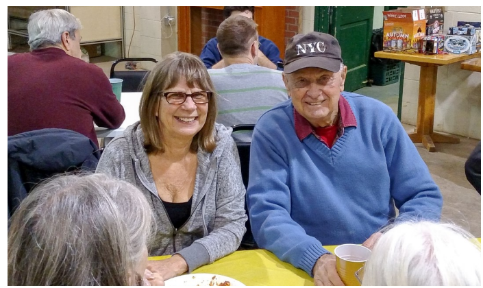
Volunteers at a Volunteer Dinner

We started a new building committee in the late Fall to begin planning for a new car storage barn and an improved and expanded shop facility. It's been a long time coming (particularly on the car storage barn), and such facilities will allow us to maintain, upgrade, and completely restore cars in our collection for enjoyment for another generation or more. We restructured our management team with changes at the President level, Trolley Operations Manager, Chief Motorman, Shop, Fleet, and Restoration Managers, and added a new Training Manager.