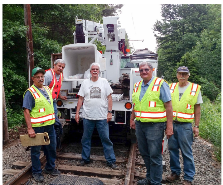
Signal Communication & Electric Traction Crew Members