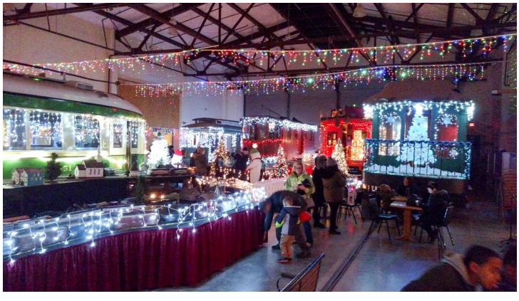
Winterfest Display Hall

Winterfest income was $97,248 which was down 7.6% from last year. This event is great for your Because we continue to make good decisions with group get together to celebrate the holiday season. Will you bring your family and friends this year?