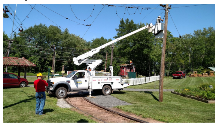
Wire Frog Repairs with S-193 and BT-1