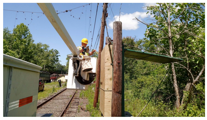
Signal Case Repairs being made

In June the failing signal case just east of Woods Barn was replaced with a new case built by Jim Miller. Ray Nobile led the crew and did a fantastic job.