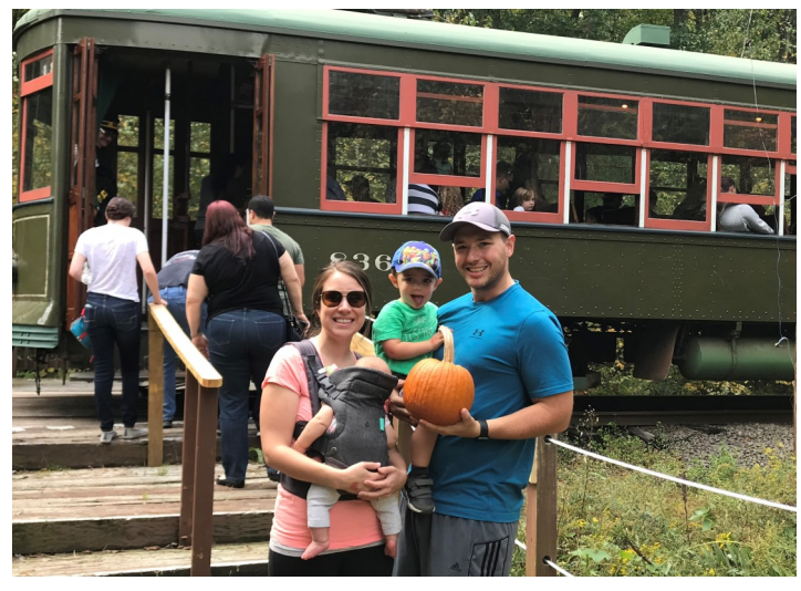
Pumpkin Patch 2018

year. We had a tough time getting Pumpkins because School Band played on two of the nights. of the wet season, but overall were able to use a few different vendors. We hosted 6 Pumpkin Patch birthday parties. On October 19th we had our second annual Homeschool Day and it proved that holding it on an event day helped with attendance.