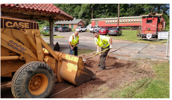
Clearing Dirt along North Road 1 for Operations

We started a new building committee in the late Fall to begin planning for a new car storage barn and an improved and expanded shop facility. It's been a long time coming (particularly on the car storage barn), and such facilities will allow us to maintain, upgrade, and completely restore cars in our collection for enjoyment for another generation or more. We restructured our management team with changes at the President level, Trolley Operations Manager, Chief Motorman, Shop, Fleet, and Restoration Managers, and added a new Training Manager.