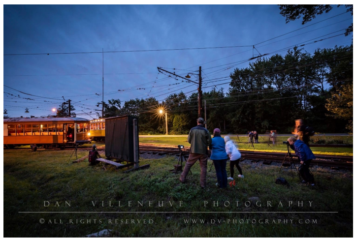
Operating Fleet during Night Time Photo Shoot

During 2018, 43 motormen volunteered their time in operations utilizing 7 cars - Montreal Tramways 4, Springfield Terminal 16, Fair Haven & Westville 355, New Orleans 836, Connecticut Company 1326, Montreal Tramways 2600, and Boston Elevated 5645.