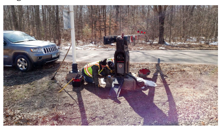
Borrup Road Gate Repairs

In June the failing signal case just east of Woods Barn was replaced with a new case built by Jim Miller. Ray Nobile led the crew and did a fantastic job.