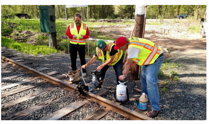
Signal Bonding at Powerhouse Crossing

Questionable signal bonds were replaced.