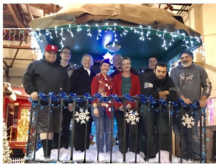
Volunteers on Last Night of Winterfest

We certainly had an eventful 2018 to look back on. We persevered through a lot of rain and other minor challenges, but most importantly, we did so together, and <u>as a team!</u> I personally can't thank all of you enough for your dedication to this organization. Our 4 key special events of Easter Bunny Fun Days, Pumpkin Patch, Rails to the Darkside, and Winterfest were very successful and contributed a great deal to our bottom line.