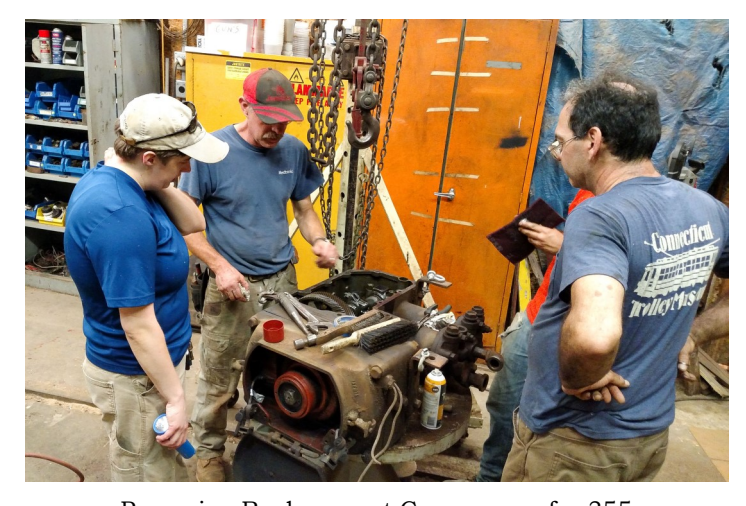
Preparing Replacement Compressor for 355

In regard to the Maintenance of the operating fleet, Connecticut Company open car shop also maintained the Line Car S193.